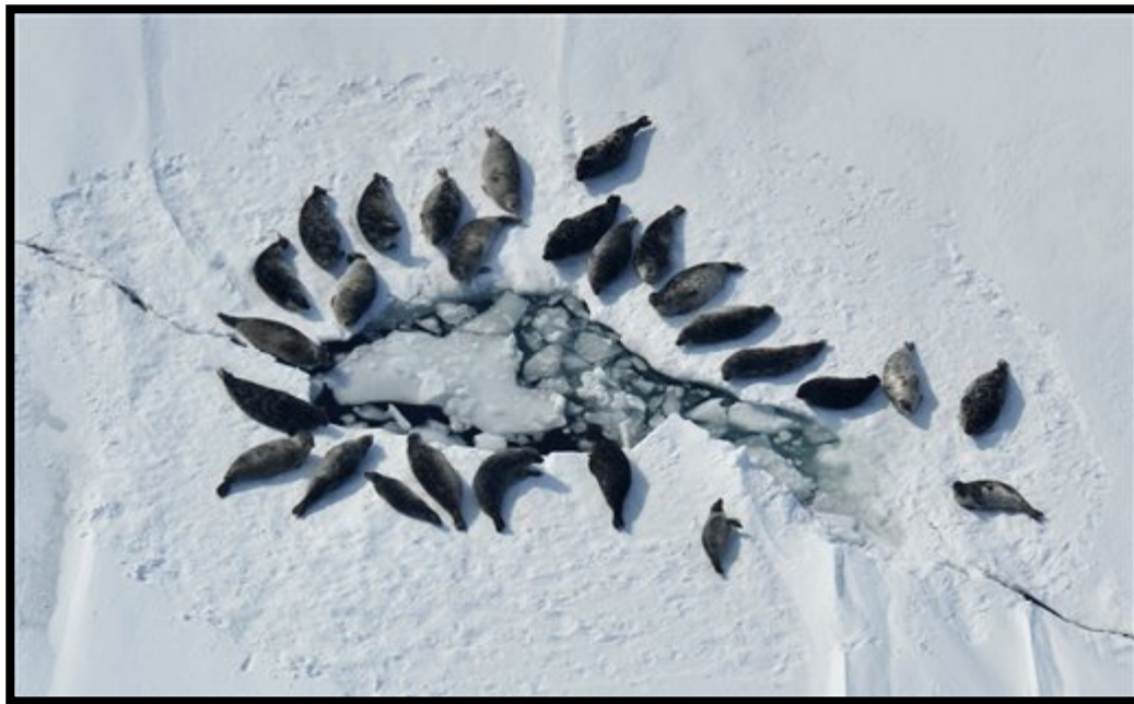
Seals at a haul-out site in Lake Iliamna, (Associated Press Photo/NOAA, Dave Winthrow).

One of the resources harvested is the Iliamna Lake seal, which has been documented as resident to the lake since at least the early nineteenth century. 13 Alaska Natives use virtually all of the seal for food, clothing, and other products. For example, after the oil and meat are processed for