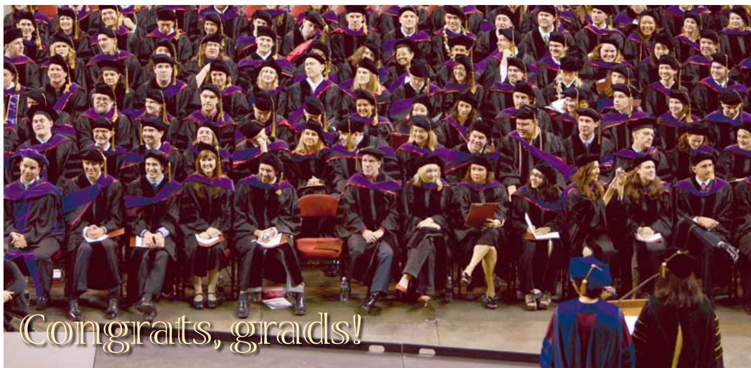
Members of the Class of 2009 await the awarding of their degrees at May Commencement at Key Arena. The School of Law graduated 279 this spring.